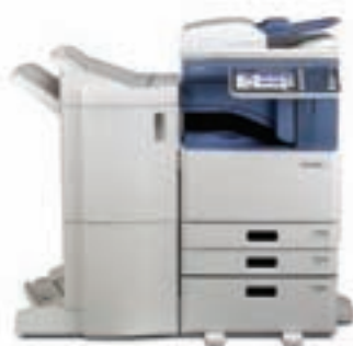
e-STUDIO3555c with Saddle-Stitch Finisher.

From our zero-waste-to-landfill toner recycling to greener manufacturing, Toshiba is a recognized environmental leader. At Toshiba we're investing in programs that help both our business and yours to better reduce, reuse and recycle.