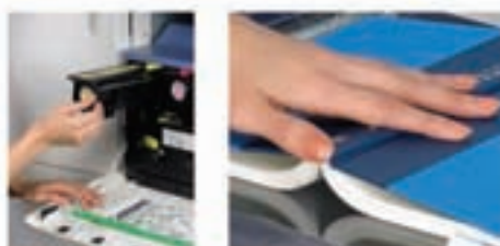
Print professional-looking, full-color newsletters and brochures using an optional saddle-stitch or staple finisher.