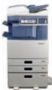
e-STUDIO3555c with Inner Finisher and LCF.