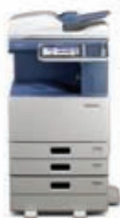
e-STUDIO3555c with Paper Feed Pedestal.